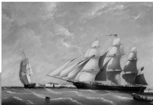
Above: This clipper ship, the Portland, was painted by J or I Tudgay, c 1850, MHS collection.

Maine Memory Network are easy to access. Simply go to the search page of www.MaineMemory.net , where you can search by keyword, or browse through a host of topics from Arts & Entertainment, to Famous People, to Nature & Geography. You can also use the Album tool to create and save your own personal archive of images — you can even make your own slide shows! MMN is an invitation to historical and personal discovery.