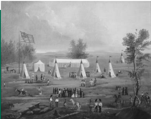
Painting by George H. Bailey of the Portland Light Infantry Muster. It is jointly owned by MHS and the Maine State Museum.

Though Maine Memory Network represents sophisticated technology, its real importance is the access it gives to content — to the materials that help us understand who we are and where we've been. Today you'll find 1,000 fully transcribed letters and journals, 300 maps, 500 postcards, 1,000 works of art, 6,000 photographs, and 400 museum objects, as well as business records, sketches, woodcuts, broadsides, clothing, tools, architectural and mechanical drawings, audio recordings, and much more. Each item comes with descriptive information and all handwritten documents are fully transcribed.