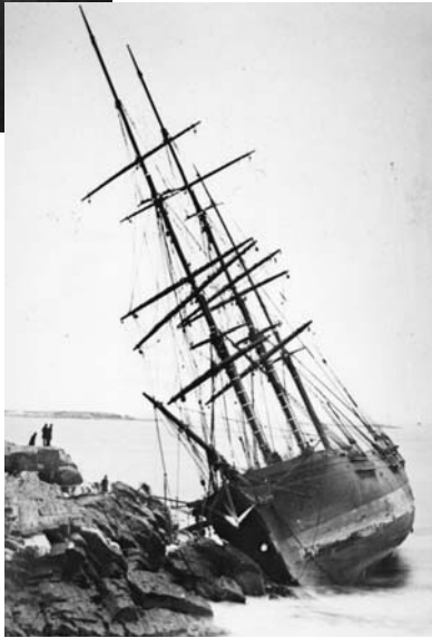
Right: Wreck of the Annie C. Maquire, Dec. 24, 1886. The rocky coastline of Cape Elizabeth has sent many vessels to their watery graves.

MMN is now the home of over 50 interpretive exhibits-with new ones added regularly. These exhibits help make the connections we all need to deepen our understanding of Maine's past. They recall events great and small, sketch famous lives, celebrate anniversaries, or just reveal the hidden corners of history. (By the way, if you'd like to receive monthly email updates with links to new exhibits see instructions below.)