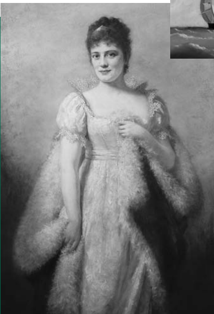
Left: Portrait of opera singer, Madame Lillian Nordica, painted c. 1878 by Hermann Schmiechen. The WWI liberty ship SS Lillian Nordica was christened in her name. She was born in Farmington and her birth home is now a museum, where this portrait resides.