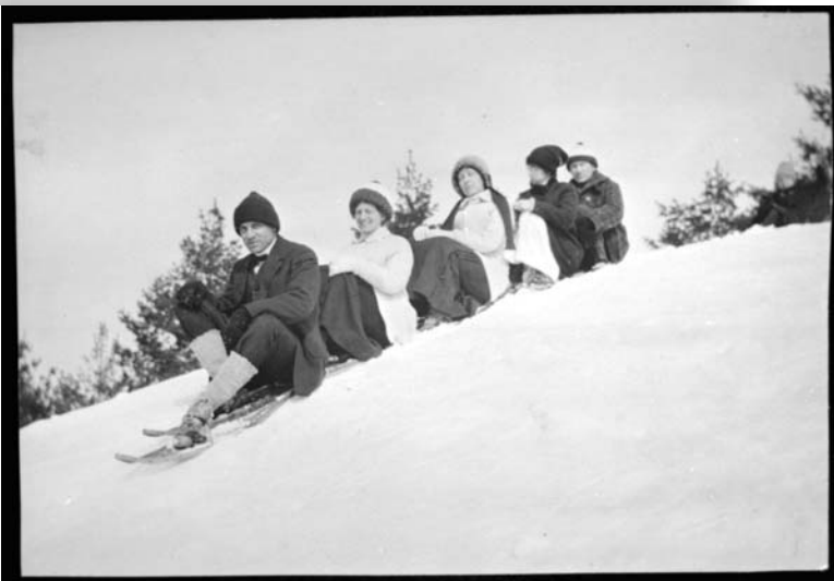
Image #6302, Snowshoe Train: members of the Hicks family making a sled out of their snowshoes, photo c. 1900, MHS collection